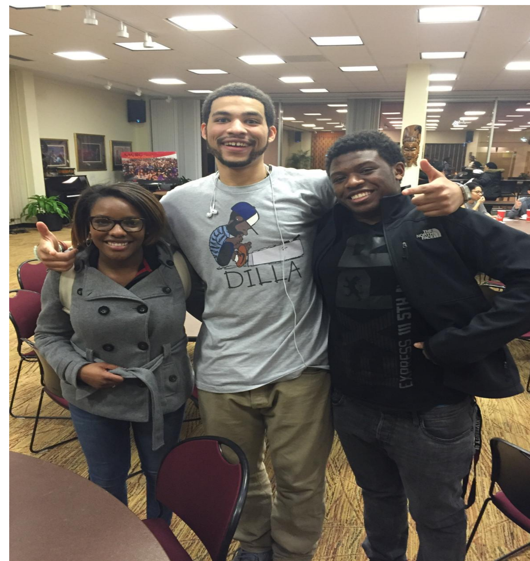
"Research in an Academic Setting" Workshop

Acknowledgements: University of Cincinnati URSC