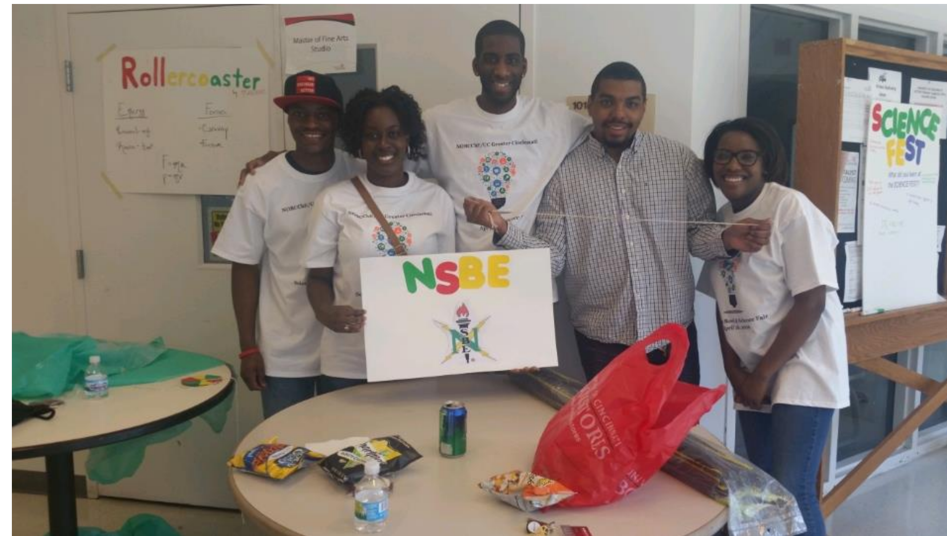
Science Bowl Volunteers